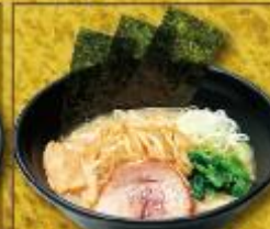
KIWAMARU With bean sprouts