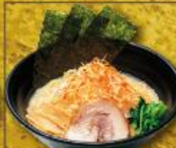
KIWAMARU With spring onion