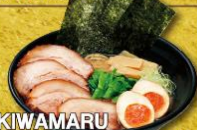
KIWAMARU With roasted pork fillet and seasoned boiled egg