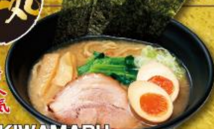
KIWAMARU With seasoned boiled egg