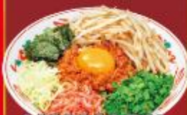
AKAMARU With bean sprouts