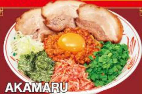
AKAMARU With roasted pork fillet