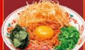
AKAMARU With spring onion